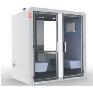
GS05PRO - Semi closed back