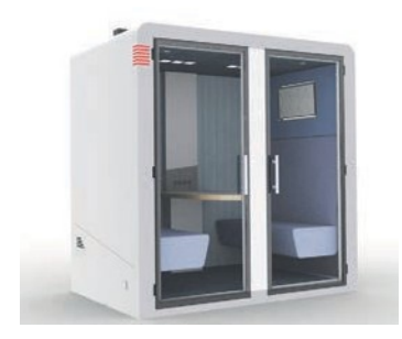
GS04PRO - Fully closed